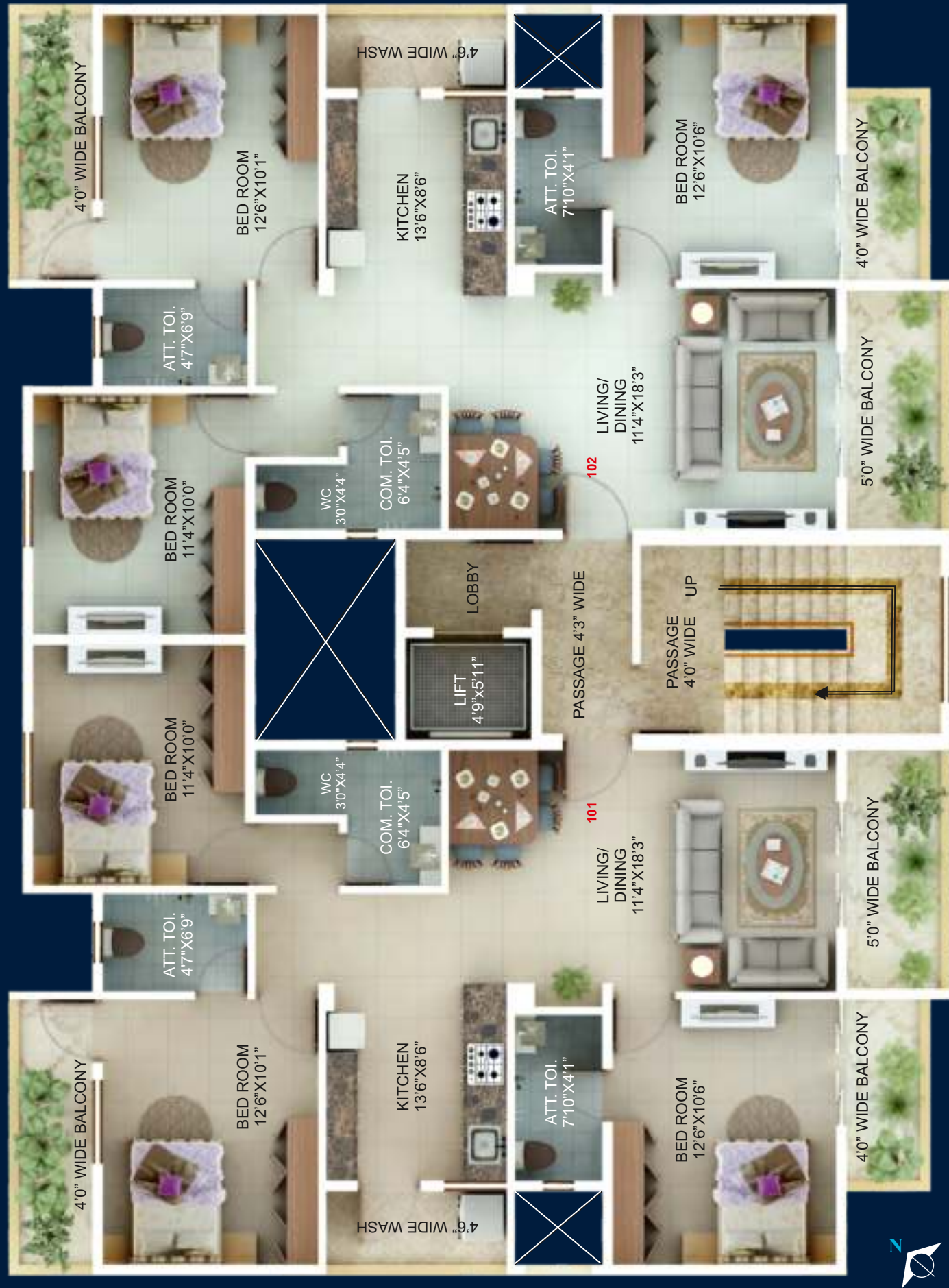
Typical 1st to 6th Floor Plan